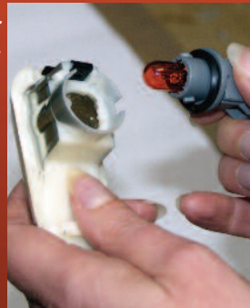
Side repeater bulbholder removal