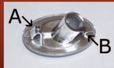
Side Repeaters showing spring clip (A) and fixed clip (B)

The repeater is removed by pushing it in the direction of the spring clip (i.e. from the fixed clip side). This allows the spring clip to compress, and the fixed clip then releases from the wing so the repeater can be pulled gently outwards and removed.