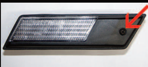
Side Repeater with screw fitment

Before you begin, please note that working on a car's electrical system can be dangerous – both to you and the car. If you are in any doubt about your ability to follow any of the techniques detailed below – don't! Rather seek professional assistance. This leaflet is offered as a guide only, and we cannot accept any responsibility if something you attempt goes wrong.